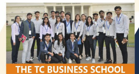
THE TC BUSINESS SCHOOL STUDENTS GOT THE CHANCE TO BE A PART OF THE E SUMMIT, ORGANISED BY IIT ROORKEE