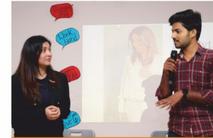
STUDENTS ORIENTATION 2023