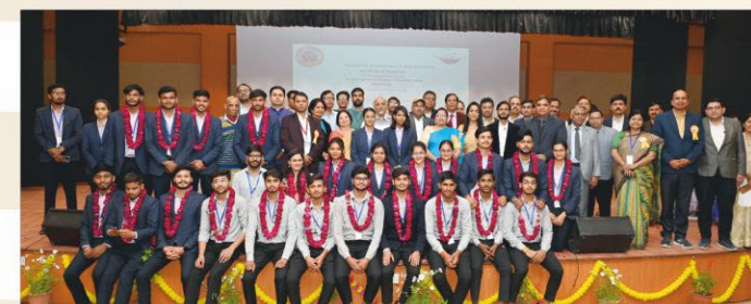
INTERNATIONAL CONFERENCE ON INNOVATIVE RESEARCH & PRACTICES (ICIRP)