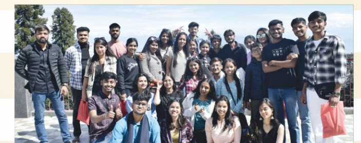
RISHIKESH FUN TRIP