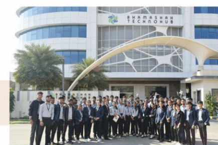
EDUCATIONAL TRIP AT BHAMASHA TECHNO HUB