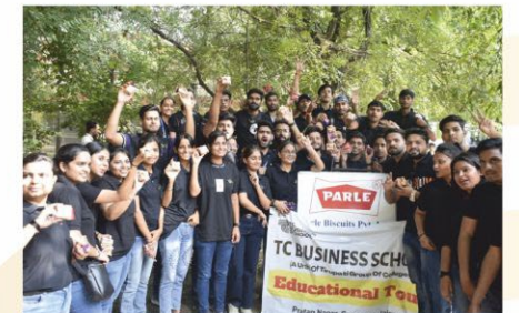
INDUSTRIAL VISIT AT PARLE-G