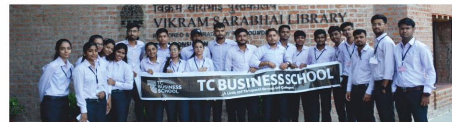
THE STUDENTS OF TC BUSINESS SCHOOL, JAIPUR HAD THE GOLDEN OPPORTUNITY TO BE A PART OF THE MANAGEMENT FEST CONDUCTED BY IIM AHMEDABAD